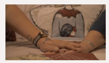
The relationships developed during care